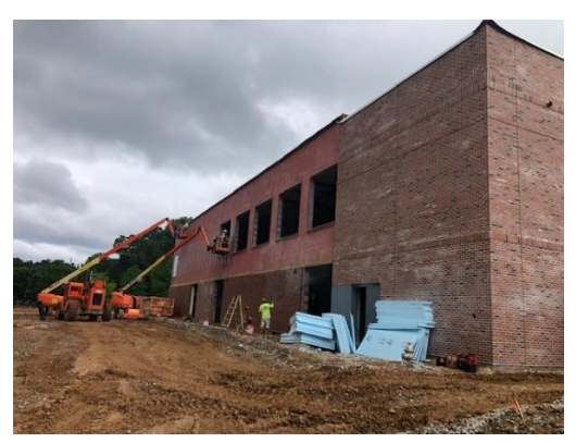
Metal Panel prep West Elevation at WPA