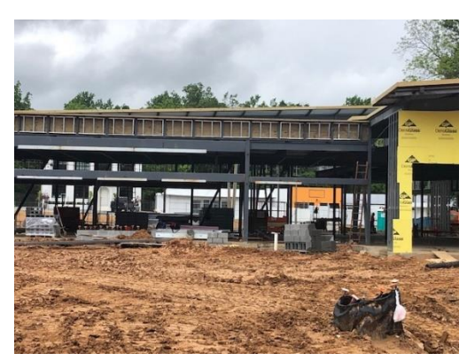
North Elevation at YMCA