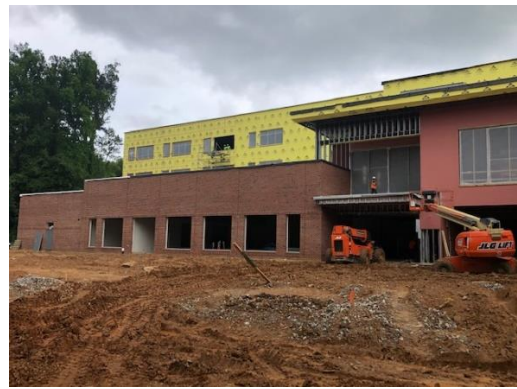
Sheathing and Air Barrier West Elevation at WPA